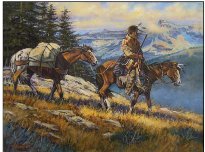
High Country (acrylic 12 x 14) – by Robert Albrecht